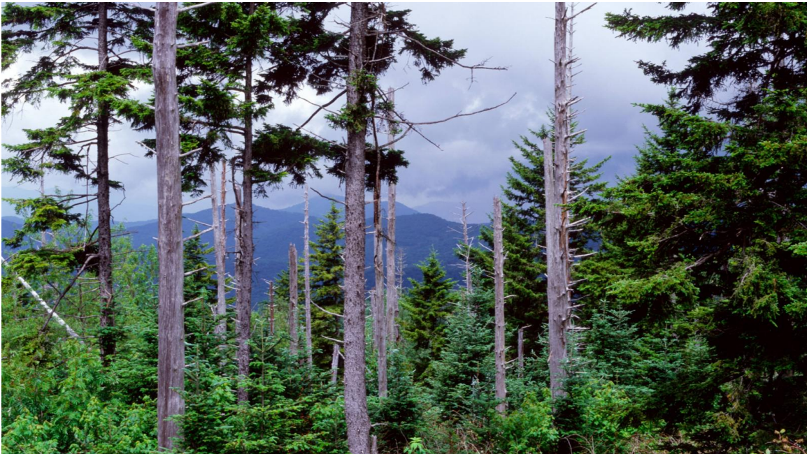
Acid rain stripped trees bare of leaves in areas of Europe affected by industrial pollution

Scientists began pinpointing culprits and journalists covered the problem through the 1970s and 1980s, but some people working in industry were doing their best to obfuscate, sow doubt and delay action.