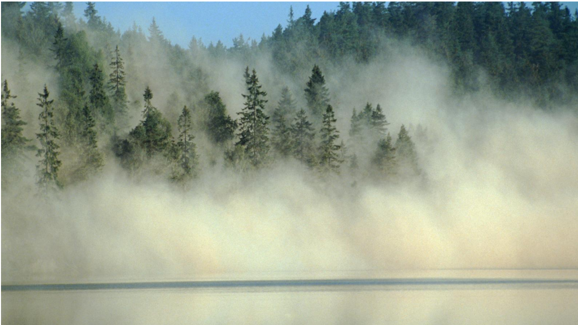
Policies to reduce acid rain in the US and Canada have been largely effective, allowing lakes to begin recovery

Despite this, emissions reductions have been a huge success story in tackling acid rain, says Likens. But further reductions, especially on nitrogen oxides, are needed. The current US president is proposing to cut back regulations on emissions. If this happens, says Likens, recovering lakes in places like the Adirondack Mountains in north eastern New York would be particularly vulnerable, their acid-neutralising capacity already weakened.